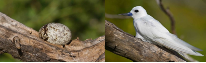
White Tern egg (left), Incubating adult (right).

White Terns do not make a nest but instead lay their single egg directly on a tree branch or other flat surface. The egg is white with brown spots and is often laid in a circular branch scar or balanced against a flake of bark. The male and female takes turns incubating the egg, which hatches after 35 days. Chicks can begin flying about 45 days after hatching but typically return to the same tree to be fed for several more weeks. White Terns nest year round and some pairs raise two or even three chicks in one year.