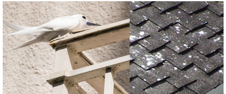
White Tern with egg on a railing (left), White Tern droppings (right)

White Terns prefer large trees for nesting. Tree species used most often are monkeypod, shower, kukui, banyan, and mahogany. Trees used frequently by White Terns can be recognized by the accumulation of pure white droppings under them. On other islands White Terns lay eggs on man-made structures, but on Oahu this is rare.