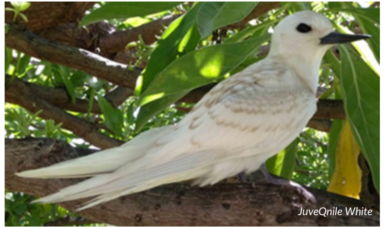
JuveQ Nile White

When White Terns are incubating, the egg often is not visible because it is covered up by the bird, but a bulge can be seen in the breast feathers of the parent. Small Chicks (< 2 weeks old) often are brooded by one parent, but sometimes they are left alone, when they are hard to see. They can be white, gray, tan, or mixed. Large chicks may walk around in the tree before they can fly. Both parents return to feed the chick every day and usually spend the night.